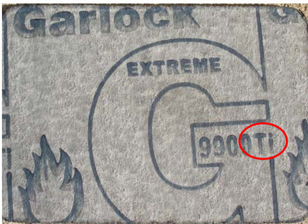
Garlock style 9900TI with colour grey

Ivano Boldo Kubo Tech AG Im Langhag 5 8307 Effretikon Switzerland